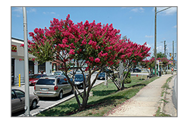
Tuskegee Crapemyrtle in bloom

Tuskegee Crapemyrtle is recommended for the following landscape applications;