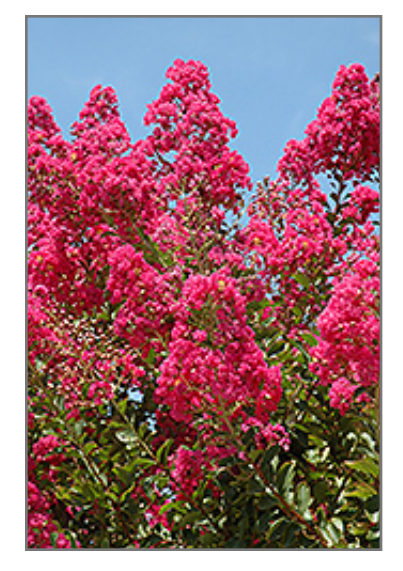
Tuskegee Crapemyrtle flowers

This is a relatively low maintenance tree, and is best pruned in late winter once the threat of extreme cold has passed. It has no significant negative characteristics.