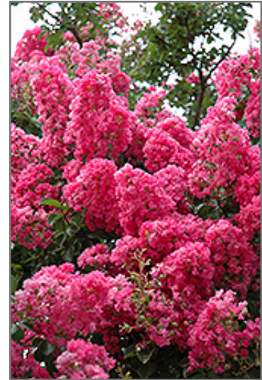
Seminole Crapemyrtle flowers