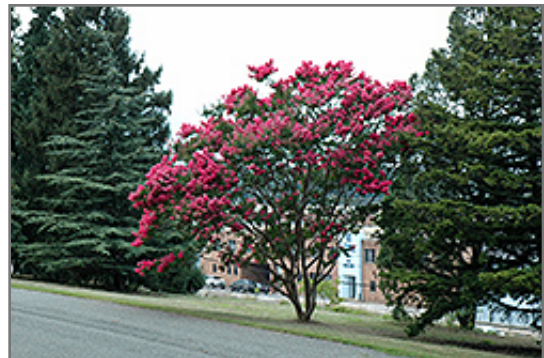
Seminole Crapemyrtle in bloom