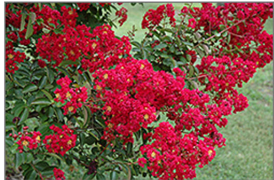
Cheyenne Crapemyrtle flowers