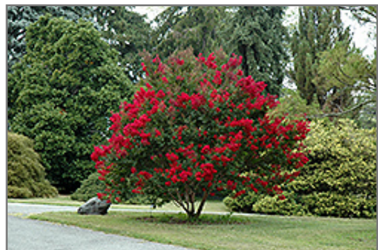
Cheyenne Crapemyrtle in bloom