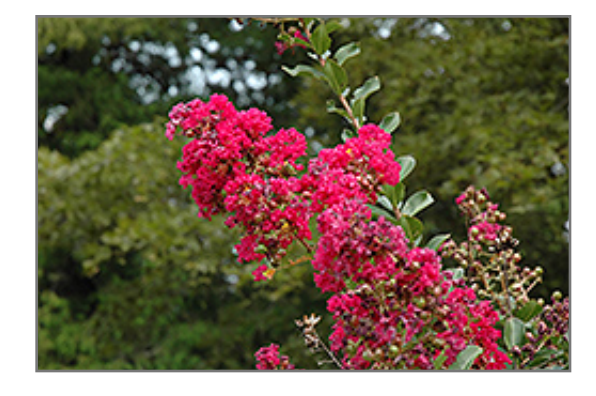
Cherokee Crapemyrtle flowers

This attractive ornamental shrub or small tree produces loads of bright red frilly blooms in summer, followed by vibrant red-orange fall foliage; a captivating focal point for the garden or border