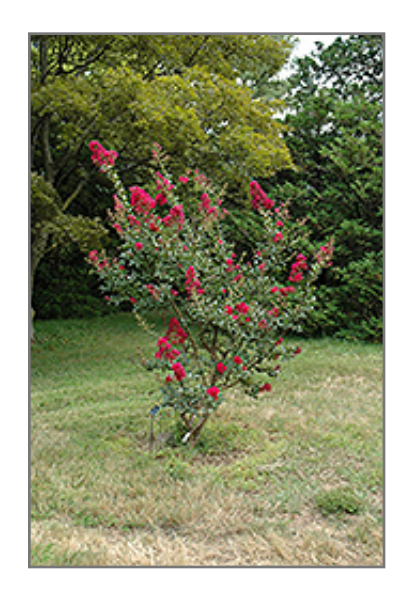
Cherokee Crapemyrtle in bloom