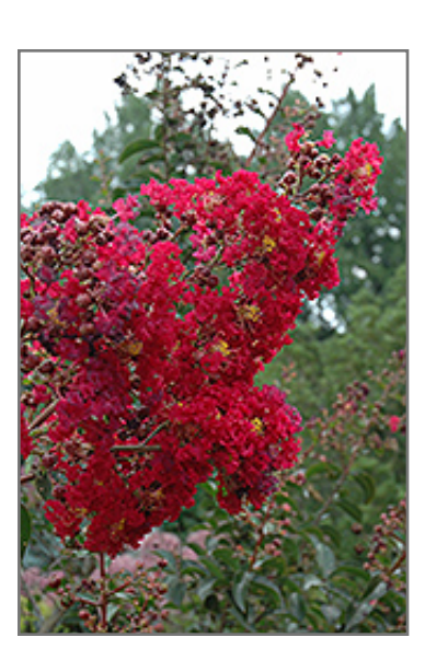
Arapaho Crapemyrtle flowers