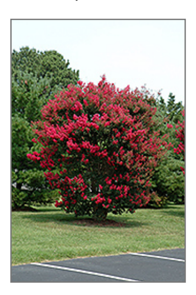
Arapaho Crapemyrtle in bloom