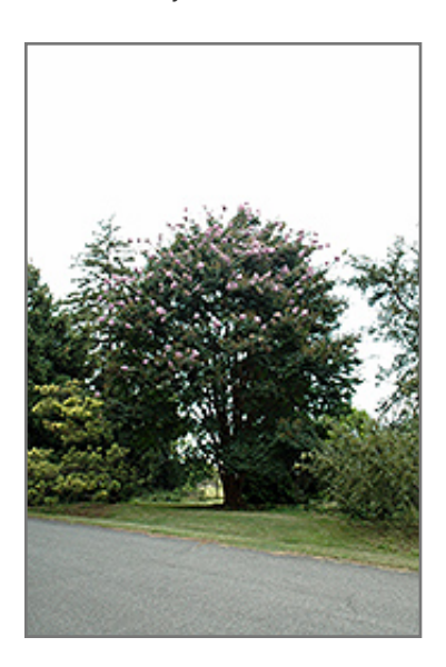
Apalachee Crapemyrtle in bloom