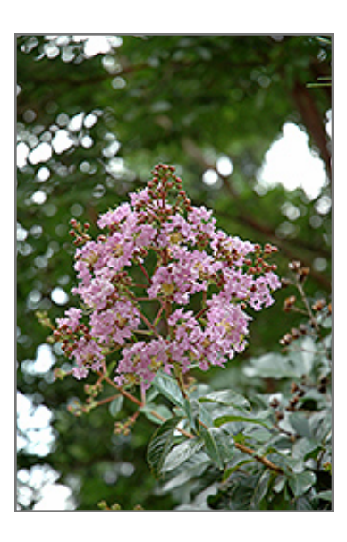
Apalachee Crapemyrtle flowers