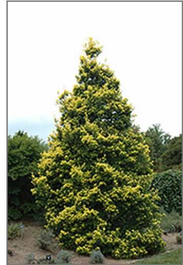
Sunny Foster Holly

Sunny Foster Holly is recommended for the following landscape applications;