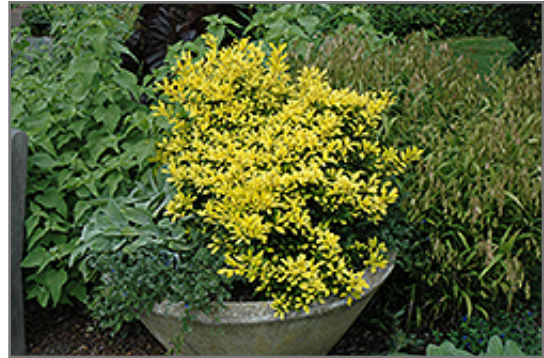
Sunny Foster Holly

Sunny Foster Holly will grow to be about 30 feet tall at maturity, with a spread of 20 feet. It has a low canopy with a typical clearance of 2 feet from the ground, and should not be planted underneath power lines. It grows at a slow rate, and under ideal conditions can be expected to live for 40 years or more. This is a female variety of the species which requires a male selection of the same species growing nearby in order to set fruit.