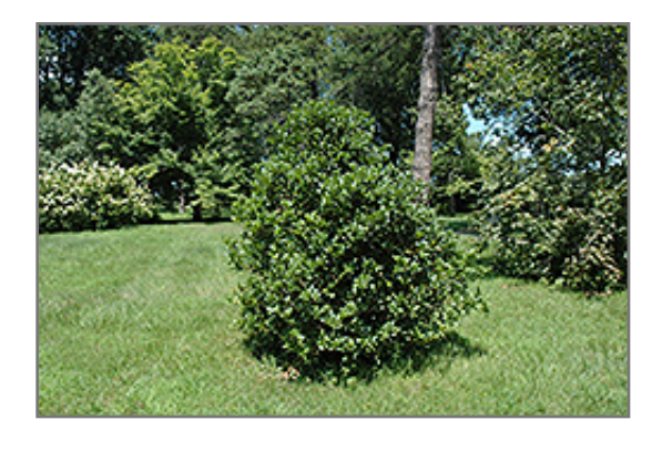
Bessie Smith Holly

This is a relatively low maintenance tree, and is best pruned in late winter once the threat of extreme cold has passed. It is a good choice for attracting birds and bees to your yard. It has no significant negative characteristics.