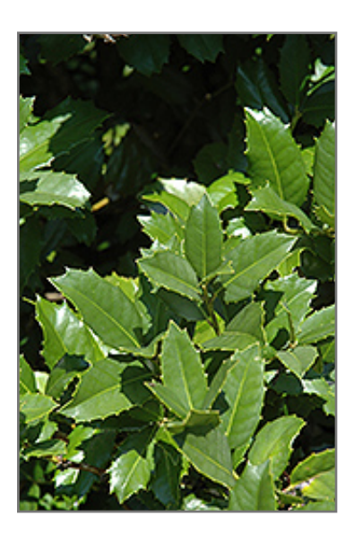
Bessie Smith Holly foliage

Bessie Smith Holly is recommended for the following landscape applications;