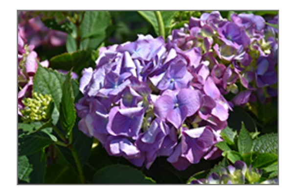
L.A. Dreamin' Hydrangea flowers

L.A. Dreamin' Hydrangea is recommended for the following landscape applications;