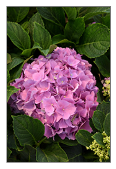
L.A. Dreamin' Hydrangea flowers

This shrub will require occasional maintenance and upkeep, and should only be pruned after flowering to avoid removing any of the current season's flowers. It has no significant negative characteristics.