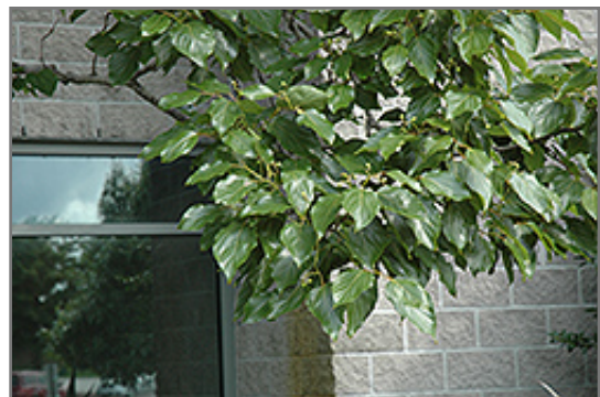
Japanese Raisin Tree foliage