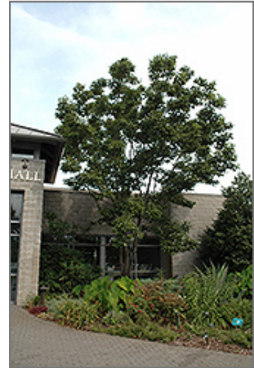
Japanese Raisin Tree

This is a relatively low maintenance tree, and should only be pruned after flowering to avoid removing any of the current season's flowers. It is a good choice for attracting birds and butterflies to your yard. It has no significant negative characteristics.