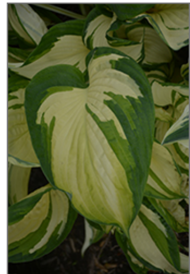
Vulcan Hosta foliage