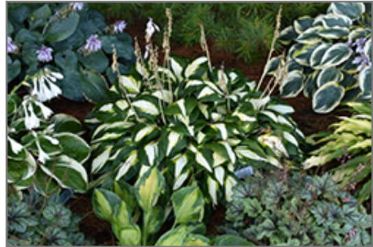
Vulcan Hosta