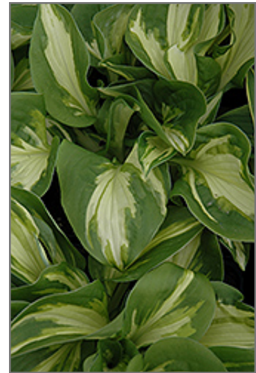
Trifecta Hosta foliage

This stunning tri-color variety produces creamy white leaves with green edges and chartreuse-gold variegation; large lavender flowers emerge in mid-summer; provides beautiful texture and color to the garden