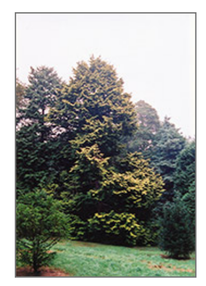
Golden Hinoki Falsecypress