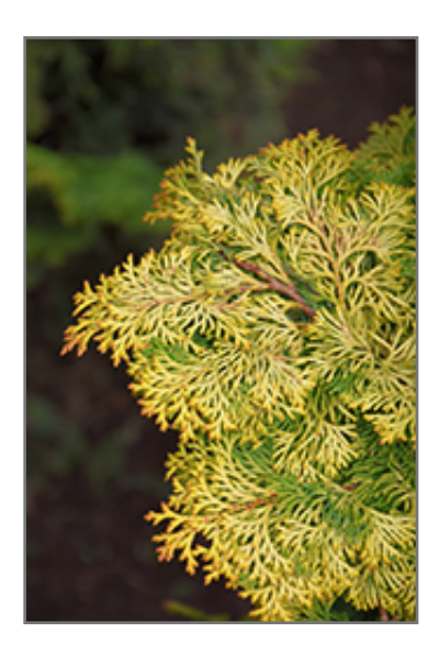
Golden Hinoki Falsecypress foliage