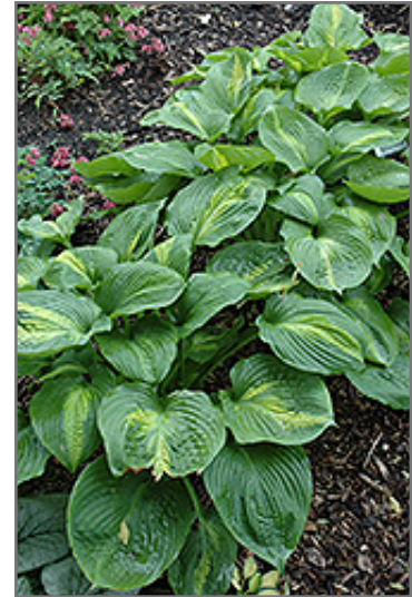
Prestige And Promise Hosta