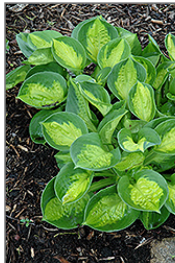
Pocketful Of Sunshine Hosta