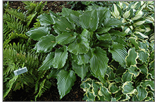
Irish Luck Hosta