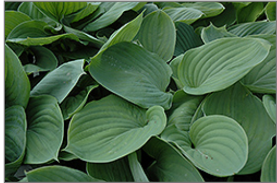
Gentle Giant Hosta foliage