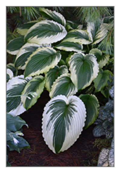
Bridal Falls Hosta foliage

Bridal Falls Hosta is a dense herbaceous perennial with tall flower stalks held atop a low mound of foliage. Its medium texture blends into the garden, but can always be balanced by a couple of finer or coarser plants for an effective composition.