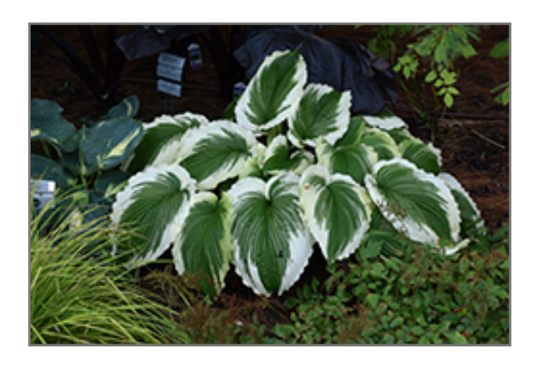
Bridal Falls Hosta

This is a relatively low maintenance plant, and is best cleaned up in early spring before it resumes active growth for the season. Gardeners should be aware of the following characteristic(s) that may warrant special consideration;