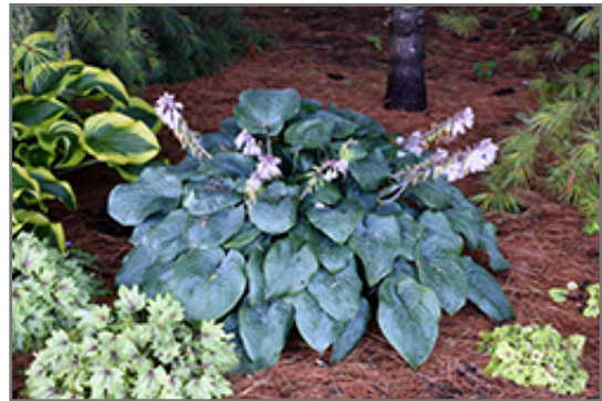
Blueberry Muffin Hosta

Blueberry Muffin Hosta is recommended for the following landscape applications;