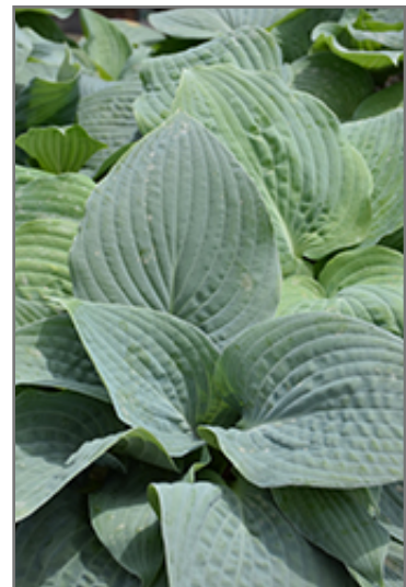
Blueberry Muffin Hosta foliage