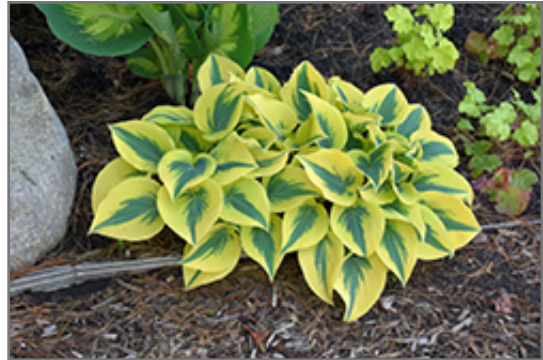
Shadowland Autumn Frost Hosta