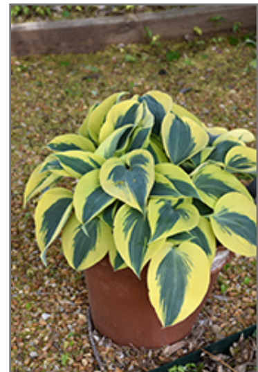
Shadowland Autumn Frost Hosta