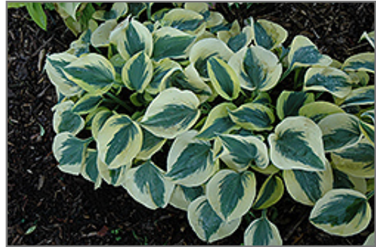
Amber Frost Hosta