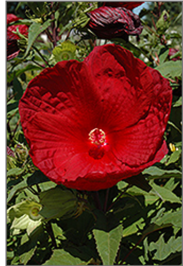
My Valentine Hibiscus flowers