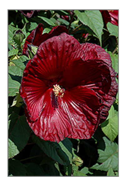
Heartthrob Hibiscus flowers

Near-black pointy buds open to reveal showy, large ruffled crimson red blooms in mid to late summer; attractive pointy mid-green leaves; do not allow to dry to wilting point