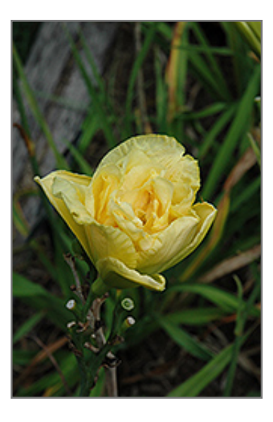
Yellow Submarine Daylily flowers

Yellow Submarine Daylily features bold fully double yellow trumpet-shaped flowers at the ends of the stems in mid summer. The flowers are excellent for cutting. Its grassy leaves remain green in colour throughout the season.