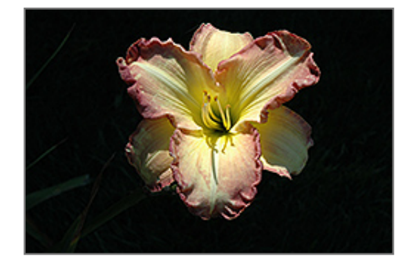
Swedish Girl Daylily flowers