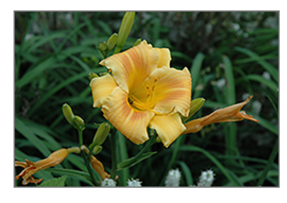
Orange Flurry Daylily flowers