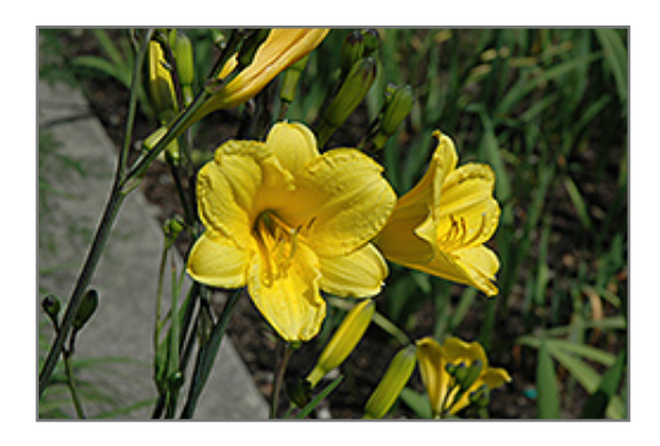
Mayan Gold Daylily flowers