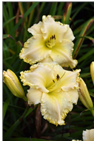
Marquee Moon Daylily flowers