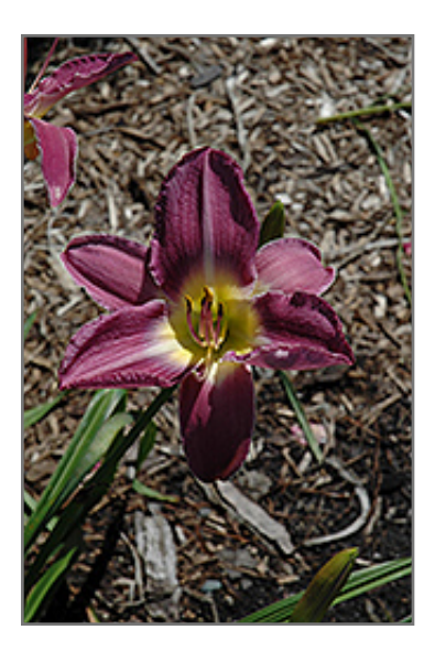
Majestic Hue Daylily flowers