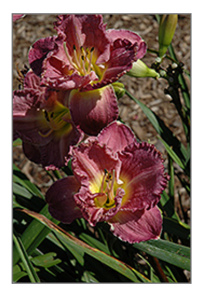
Magic Amethyst Daylily flowers

Stunning, amethyst-purple blooms with luminous lemon centers; re-blooms in late summer; dormant tetraploid; a spectacular color accent to the garden or border