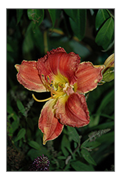
High Voltage Daylily flowers

Striking, triangular shaped, large cherry red trumpets with yellow centers; re-blooming; great grassy texture and form; tetraploid; a luminous color addition to the garden or border