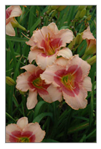
Exotic Candy Daylily flowers

Ruffled, very fragrant light pink flowers with dark rose eyes and bright yellow-green throats; re-blooming; great grassy texture and form; an elegant color addition to the garden or border