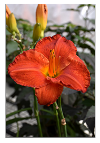
Desert Flame Daylily flowers

Stunning, large red-orange blooms with luminous yellow centers and pale cream stripes radiating outward; re-blooms in late summer; dormant tetraploid; a spectacular color accent to the garden or border