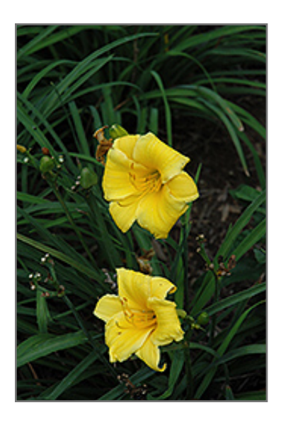
Platinum Palette Buttercup Babies Daylily flowers