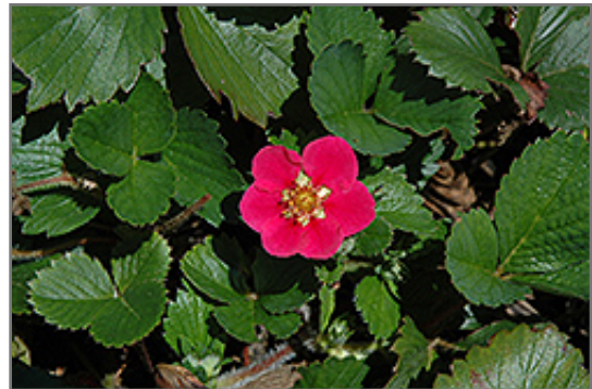
Tristan Strawberry flowers

Tristan Strawberry features showy hot pink cup-shaped flowers with gold eyes along the stems from mid spring to late summer. Its serrated round compound leaves remain dark green in colour throughout the season. It features an abundance of magnificent red berries from late spring to early fall.