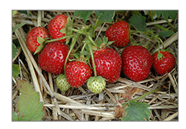
Jewel Strawberry fruit

Jewel Strawberry features dainty white cup-shaped flowers with lemon yellow eyes along the stems from mid to late spring. Its serrated round compound leaves remain dark green in colour throughout the season. It features an abundance of magnificent red berries in early summer.