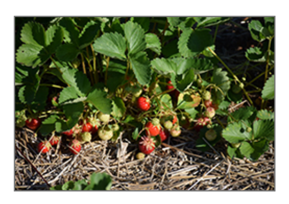
Jewel Strawberry fruit