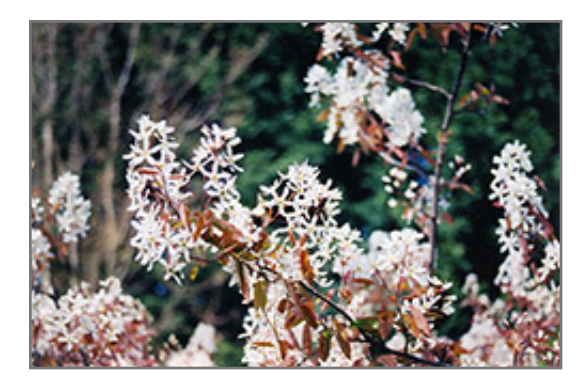
Cole's Select Serviceberry flowers