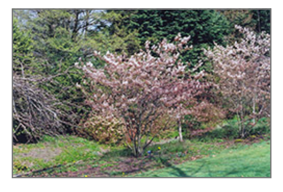
Cole's Select Serviceberry in bloom