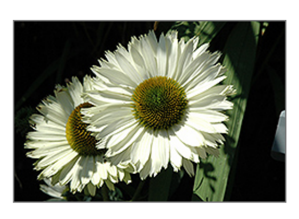
Virgin Coneflower flowers

This elegant echinacea produces pure white flowers with coppery centers; a perfect choice for planting in groups, along border edges, or in containers; great for flower arrangements, attracts pollinators