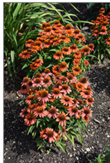
Sombrero Adobe Orange Coneflower in bloom