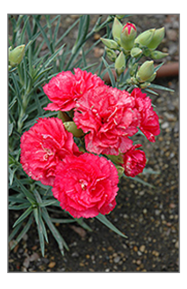
Can Can Rose Carnation flowers

Fully double rose carnations with fringed petal edges bloom consistently over a long season, especially in warmer climates; great for border fronts, containers, and floral arrangements