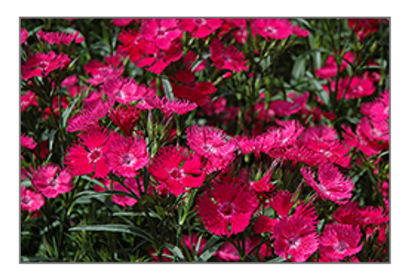
Bouquet Rose Pinks flowers

This is a relatively low maintenance plant, and is best cleaned up in early spring before it resumes active growth for the season. It is a good choice for attracting bees and butterflies to your yard, but is not particularly attractive to deer who tend to leave it alone in favor of tastier treats. It has no significant negative characteristics.