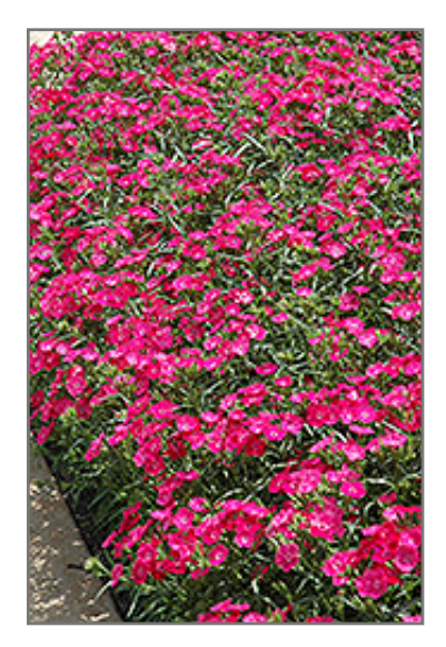
Bouquet Rose Pinks in bloom