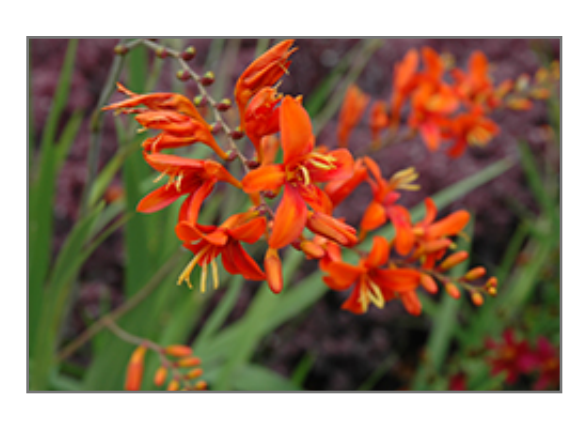
Bright Eyes Crocosmia flowers

Breathtaking orange flowers with scarlet red centers rise above iris-like foliage in mid to late summer; attracts hummingbirds; best performance in full-sun; free flowering with upright, front facing blooms; can be lifted in fall