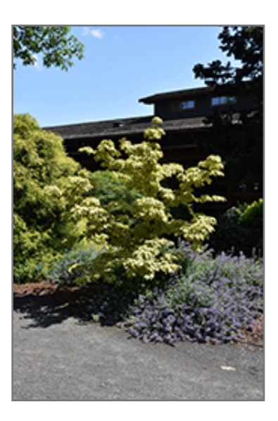
Summer Gold Chinese Dogwood

This is a relatively low maintenance shrub, and should only be pruned after flowering to avoid removing any of the current season's flowers. It is a good choice for attracting birds to your yard. It has no significant negative characteristics.