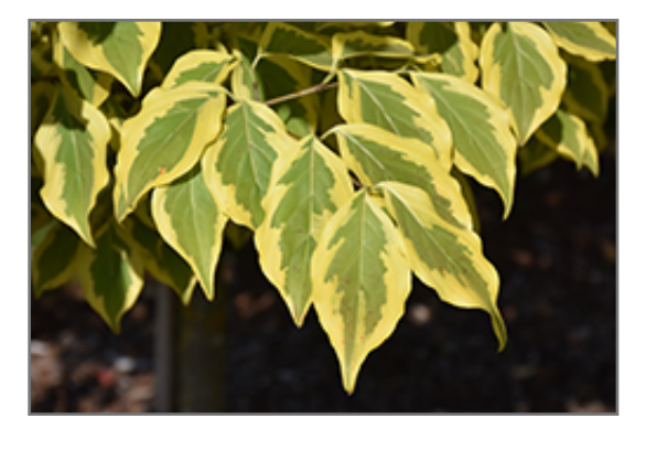
Summer Gold Chinese Dogwood foliage

Summer Gold Chinese Dogwood is a multi-stemmed deciduous shrub with an upright spreading habit of growth. Its average texture blends into the landscape, but can be balanced by one or two finer or coarser trees or shrubs for an effective composition.