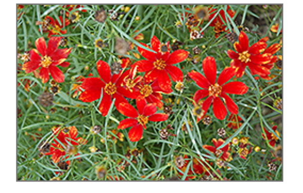
Broad Street Tickseed flowers