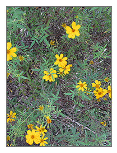
Greater Tickseed in bloom