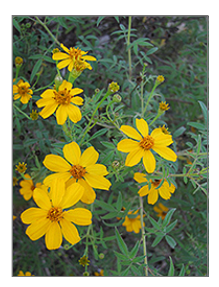
Greater Tickseed flowers