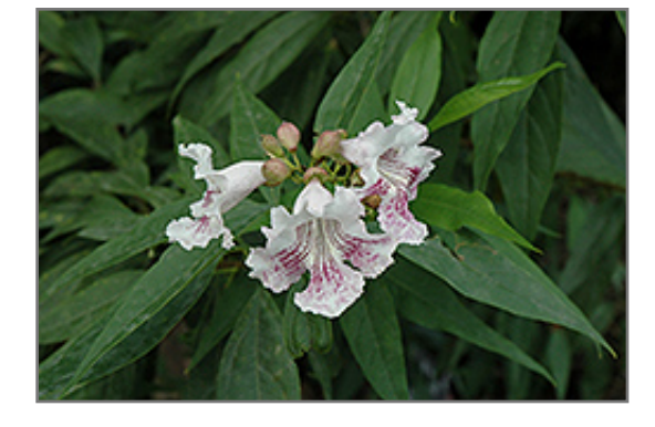
Morning Cloud Chitalpa flowers

Morning Cloud Chitalpa is a multi-stemmed deciduous tree with an upright spreading habit of growth. Its relatively coarse texture can be used to stand it apart from other landscape plants with finer foliage.