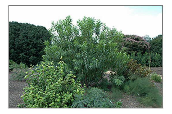
Morning Cloud Chitalpa

This tree will require occasional maintenance and upkeep, and is best pruned in late winter once the threat of extreme cold has passed. It is a good choice for attracting hummingbirds to your yard, but is not particularly attractive to deer who tend to leave it alone in favor of tastier treats. Gardeners should be aware of the following characteristic(s) that may warrant special consideration;