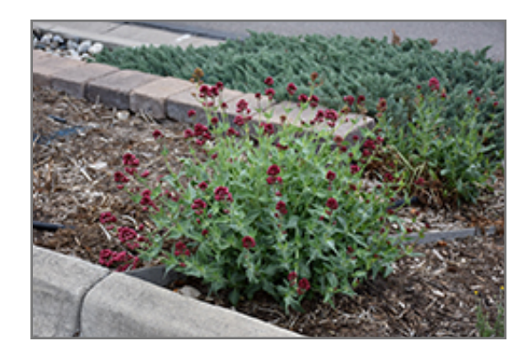
Red Valerian in bloom