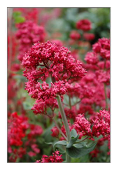
Red Valerian flowers

This is a relatively low maintenance plant. Trim off the flower heads after they fade and die to encourage more blooms late into the season. Gardeners should be aware of the following characteristic(s) that may warrant special consideration;