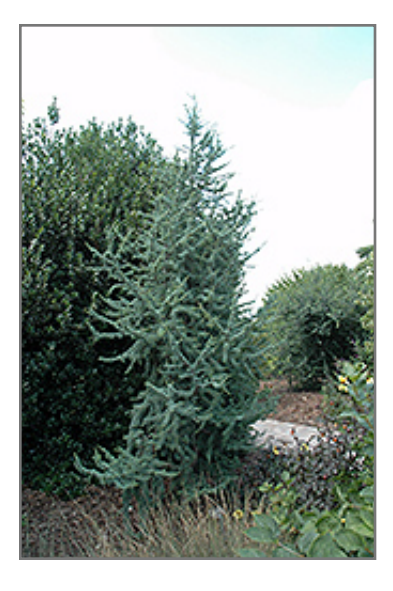
Argentea Fastigiata Atlas Cedar