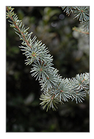
Argentea Fastigiata Atlas Cedar foliage