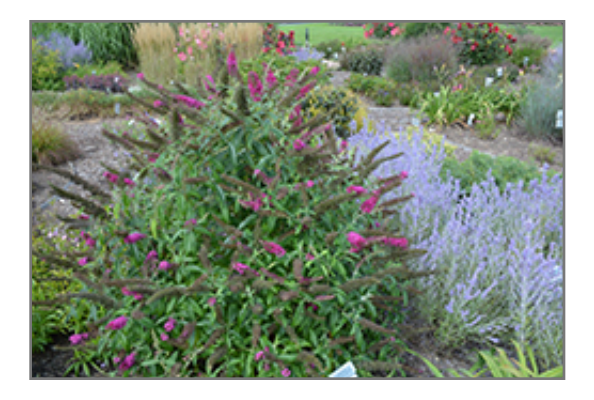
Monarch Queen Of Hearts Butterfly Bush in bloom