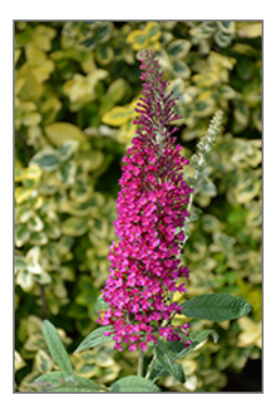
Monarch Queen Of Hearts Butterfly Bush flowers

Monarch Queen Of Hearts Butterfly Bush is an open multi-stemmed deciduous shrub with an upright spreading habit of growth. Its average texture blends into the landscape, but can be balanced by one or two finer or coarser trees or shrubs for an effective composition.