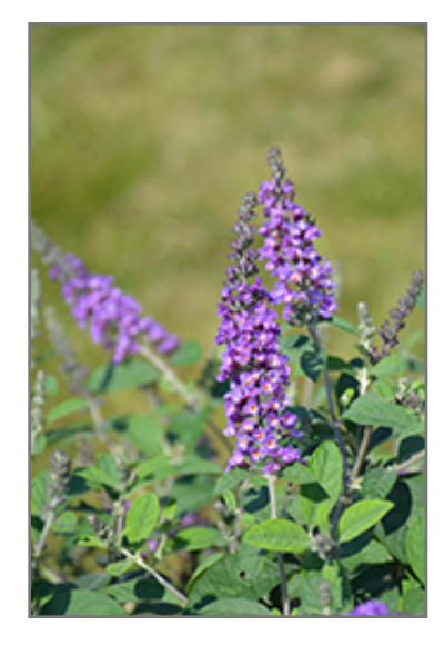
Lo & Behold Blue Chip Jr. Butterfly Bush flowers

Lo & Behold Blue Chip Jr. Butterfly Bush is a multi-stemmed deciduous shrub with a mounded form. Its average texture blends into the landscape, but can be balanced by one or two finer or coarser trees or shrubs for an effective composition.