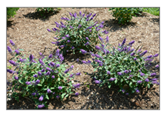
Lo & Behold Blue Chip Jr. Butterfly Bush in bloom